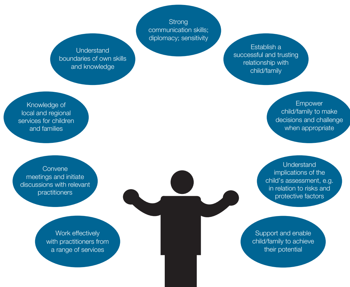
Figure 3: Useful skills for carrying out the lead professional functions

3.2 Lead professionals, like all practitioners, should understand information sharing procedures and issues around client confidentiality. Don't worry if you feel there are areas you need to develop – use Figure 3 as the basis for a discussion with your line manager.